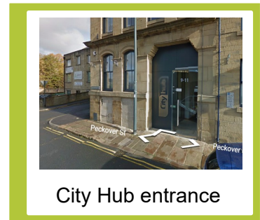
City Hub entrance

There are a number of pay and display accessible parking bays in the area. All charges are £1.60 for up to 2 hours, £3.20 for up to 4 hours.